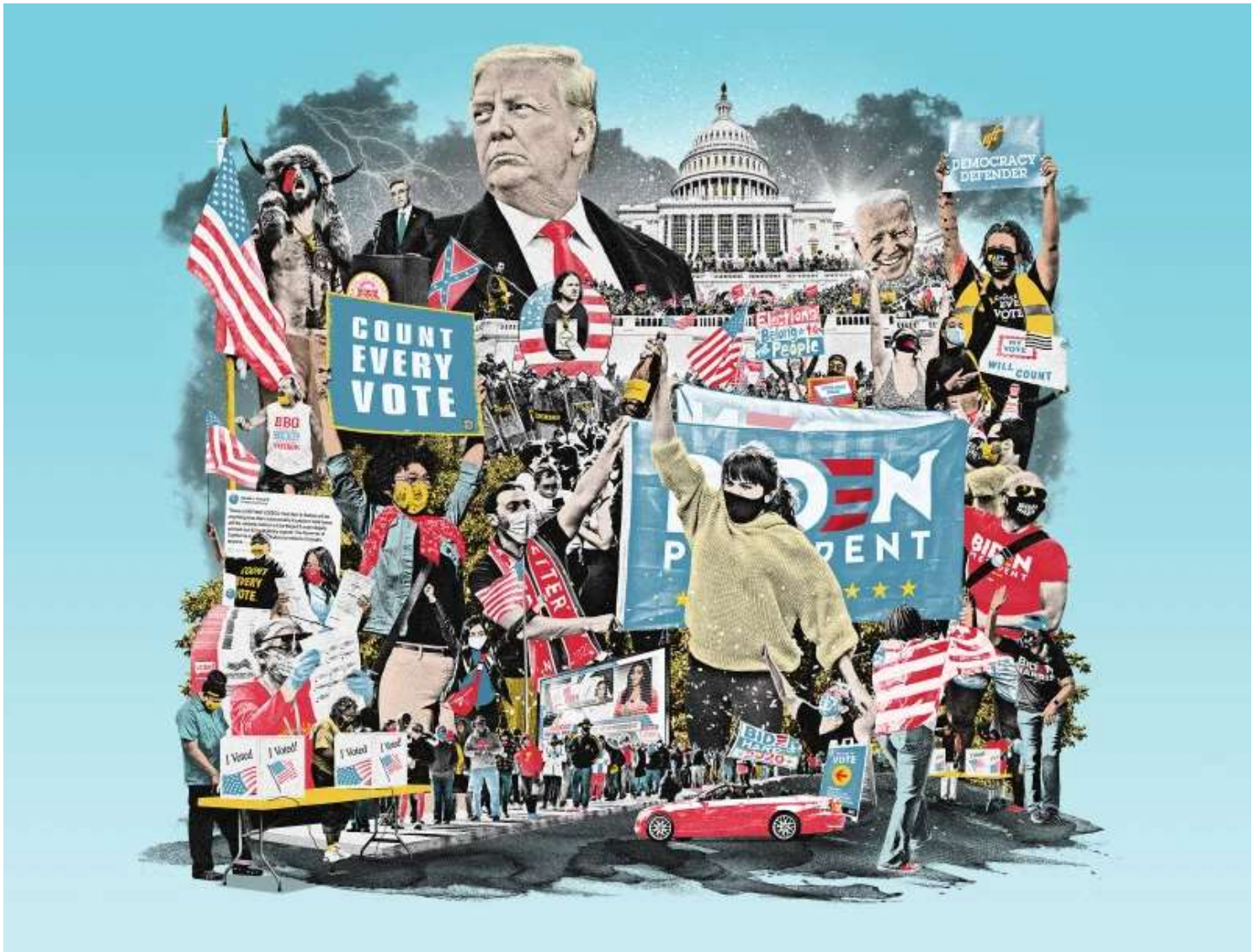
Illustration by Ryan Olbrish for TIME